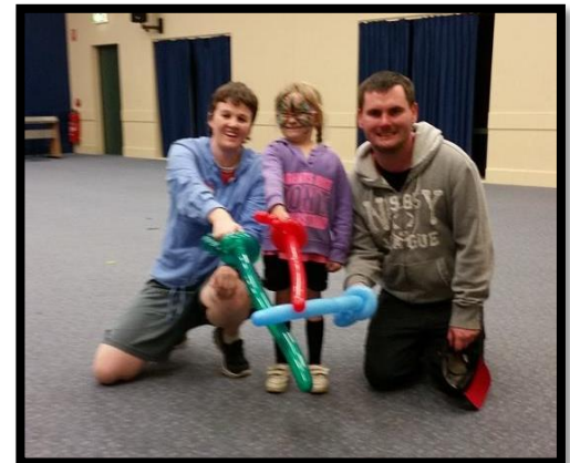
There is a new set of musketeers in town