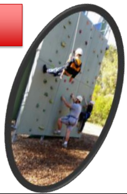
Whatever you do don't look down !

The Burns Support Foundation would like to thank all the families and friends who attended a Wonderful camp at The Tops Conference Centre