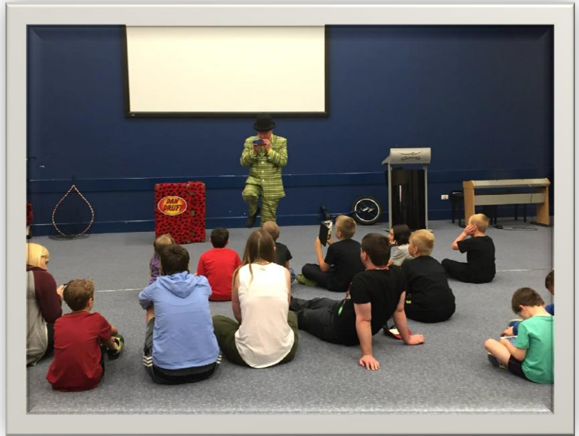
Night time entertainment for all ages