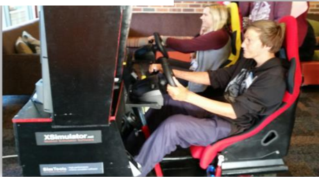
Dave's Motion racers were a huge hit with the kids (big ones especially)