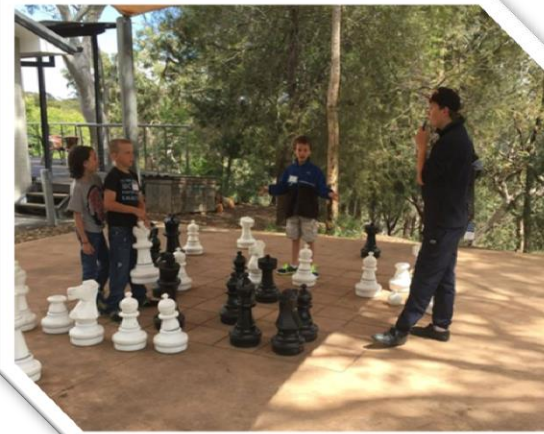
I wonder what the next move will be

Camp Activities will include Zinta's Games, Vertical Challenge, Orienteering, Abseiling, laser tag and sports games. Night time entertainment will include a magician and some trivia to follow so make sure you bring your thinking caps.