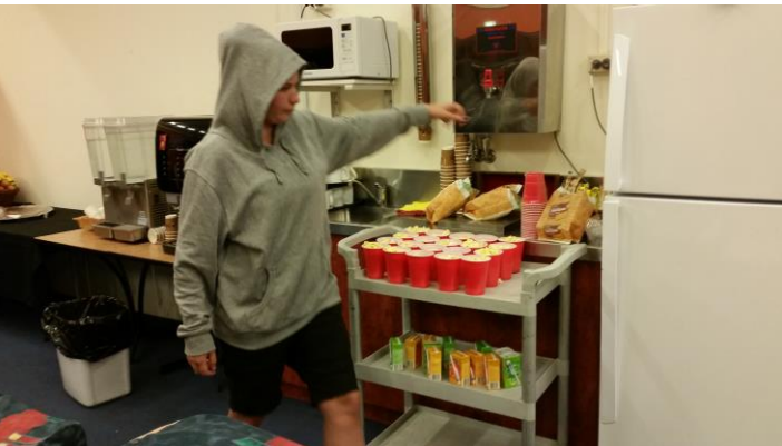
Movie night with popcorn chocolates and drinks